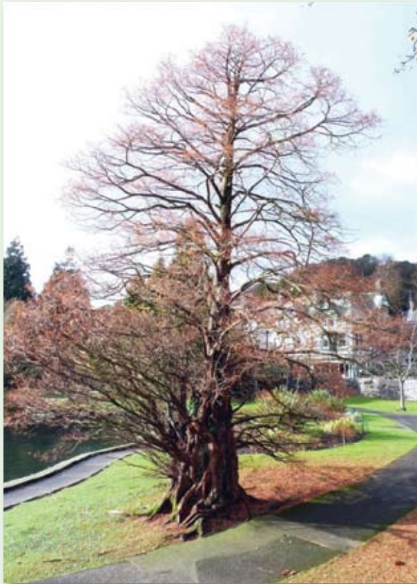
Dawn Redwood by the pond in late Autumn

This walk provides a tour of these amenities including the Memorial Gardens and Community Orchard together with trees and shrubs of the former Yewbarrow Lodge.