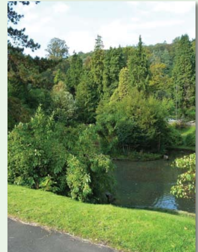
Ornamental pond from the railway